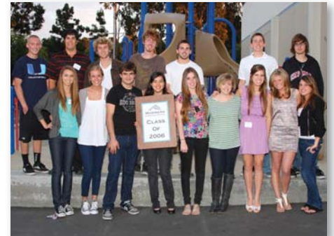
MCS Alumni Reunion 2010 welcomed over 100 graduates - high school through post-college - back on campus for fun, food, fellowship, and volleyball.

Each year, Mariners Christian School alumni are accepted into top colleges and universities across the country. Our surveys show that the academic and spiritual foundation graduates received while at MCS serve them well during high school and college. Here is a list of college choices for our most recent high school seniors (MCS Alumni Class of 2006):